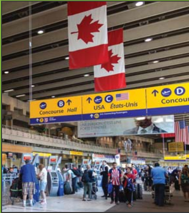
YYC Calgary International Airport