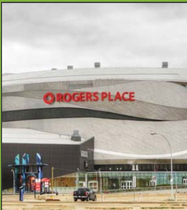
Rogers Place Arena, Edmonton